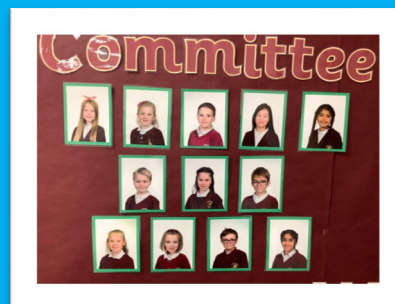
ASJ Eco Committee