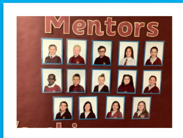
ASJ Peer Mentors