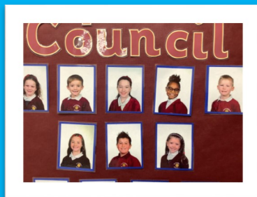
ASJ Sports Councillors